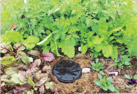
Vegetable garden #4, with the worm feeder doing its job – less than one month from planting the seedlings

(see photo), and the visitors to the demonstration enjoyed seeing the worms wriggling on the sides and the bottom of the hole when I lifted the feeder up.