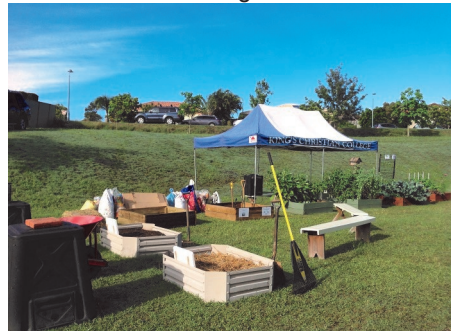
Preparations for the “No-Dig Garden” demo

I was indeed smiling by the time the Craft Fair ended. We’ve invited people back to see how the newly planted lettuces are growing, and the garden in general is progressing – so I’m looking forward to spending lots more time in our “Garden for the Village”.